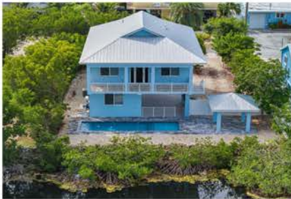
124 Venetian Way | Asking $1,625,000