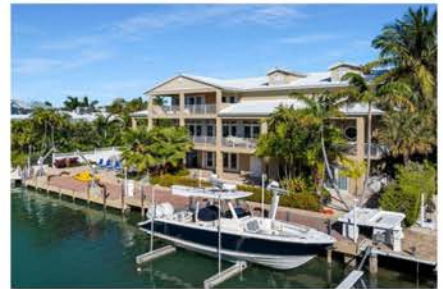
153 Stromboli Dr | Asking $4,650,000