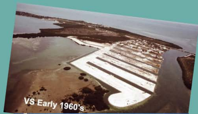
VS Early 1960's

Did you know the VSHA website features historical photos, meeting minutes, and more? Check it out!