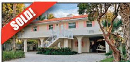
140 SEVERINO • $2,600,000 2 bed/2 bath • Pool • 100' Dock