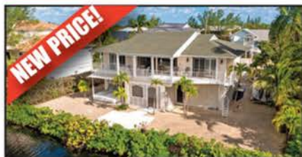
106 SAN JUAN • $1,940,000 3 bed/3 bath • Furnished • Boat Slip