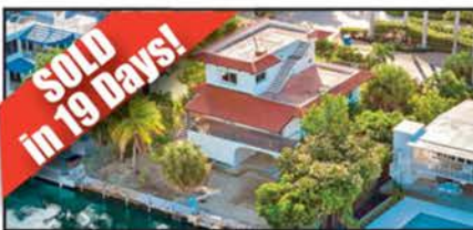
119 SEVERINO • $2,050,000 Bay View Top Deck • 3/2 • 70' Dock