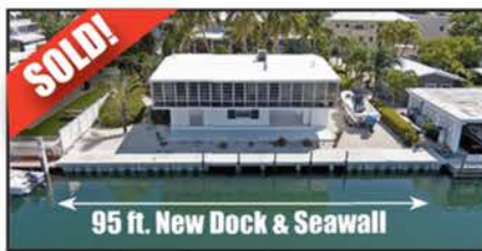
148 LEONI • $2,575,000 3 bed/3 bath • New 95' Dock & Seawall