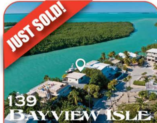
139 BAYVIEW ISLE

WE JUST SOLD OUR LISTING ON SNAKE CREEK!